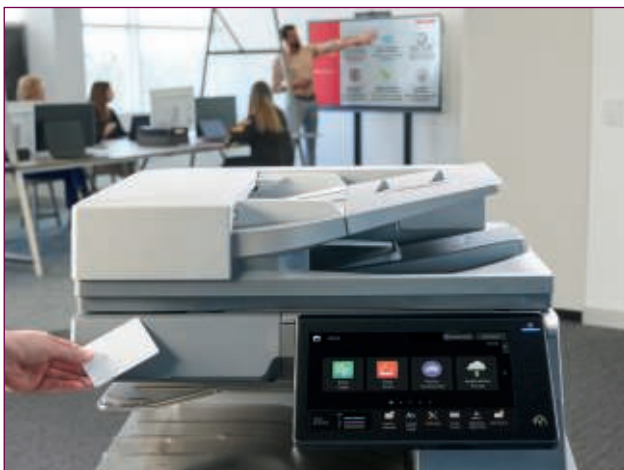
Users can authenticate themselves with an ID card.

Information that is exchanged between an MFP and another application or email system can be intercepted or compromised. These MFPs provide the same high-level protection used by many government organisations. Their SSL/TLS Certificate Validation automatically checks that all third-party servers communicating with your MFP are safe, in order to prevent any unauthorised or malicious attempts to access your information.